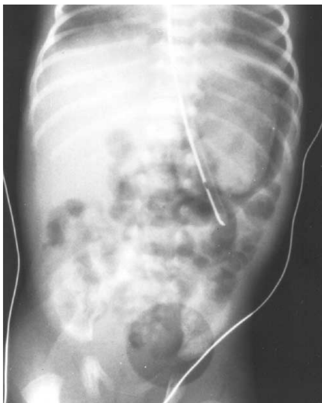
Figure 2. Intraluminal mass in stomach. Reproduced with permission (Ref [22]), p426.

The response of the formula manufacturers appears swift. Mead-Johnson introduced a whey-predominant premature infant formula in 1979 (still named Enfamil Premature Formula) (Mead-Johnson, personal communication). Ross Laboratories introduced Similac Special Care in 1980. 15 However, I was unable to determine if the formula changes resulted from the lactobezoar epidemic or