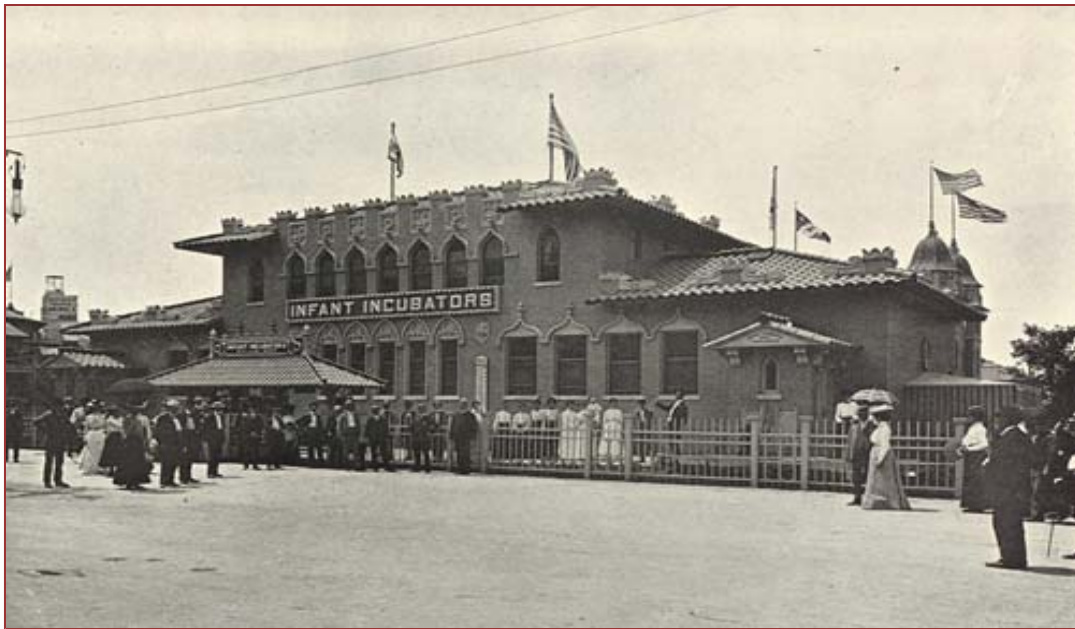
The Infant Incubator Building with "a constant stream of people going in and out."